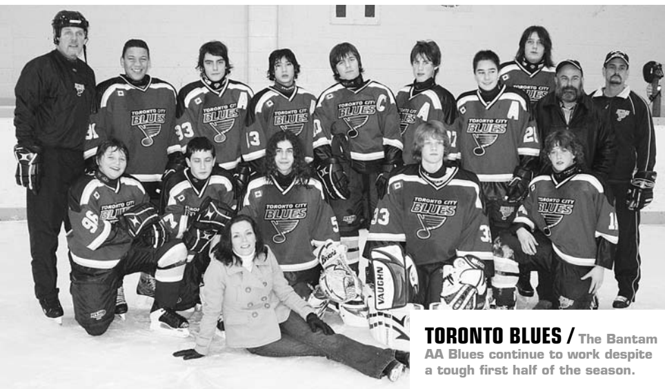
TORONTO BLUES / The Bantam AA Blues continue to work despite a tough first half of the season.